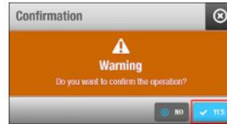
Abbildung 103: Bestätigungsmeldung zur Personenspernung

Klicken Sie auf Update sperren . In einem Dialogfeld werden Sie anschließend aufgefordert, die Sperrung der Person zu bestätigen.